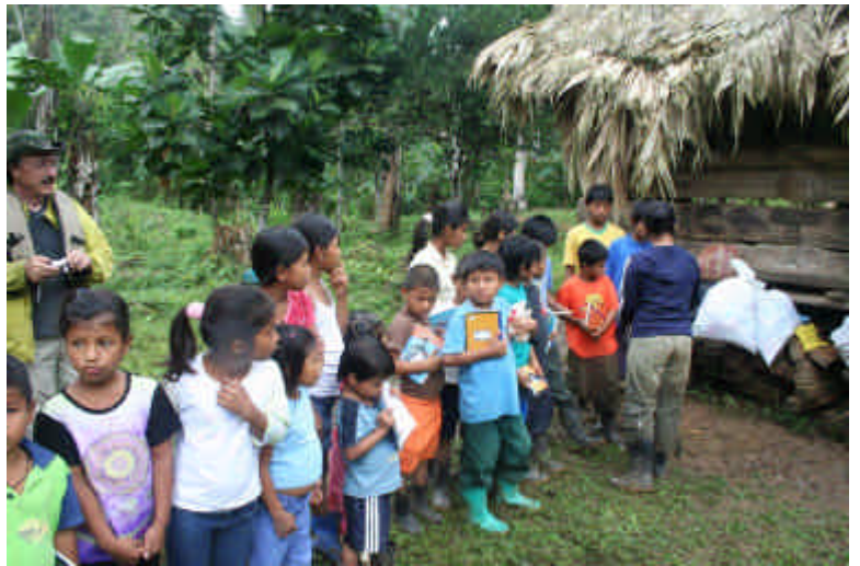
The people from Alto Katsi, a community with about 30 families and 23 children in school used to work in the plantain fields in the area.